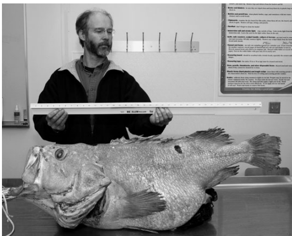
Figure 1. A big (1.1 m), old (ca.100 years), fat (27.2 kg), fecund female fish, in this case a shorttraker rockfish ( Sebastes borealis ) taken off Alaska.

Herein, we review the biological traits that vary with fish size and/or age and the implications of these traits for population resilience. We do not explicitly consider the economic benefits or costs of management strategies that preserve BOFFFFs. For many fisheries, larger individuals are more valuable economically and there are potential financial trade-offs between harvesting these fish vs.